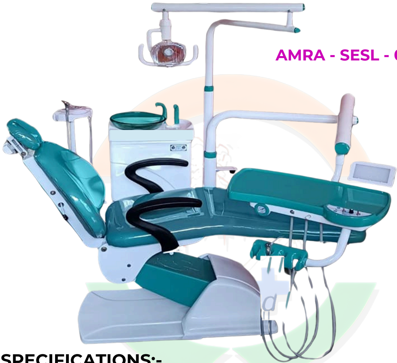
AMRA - SESL - 01